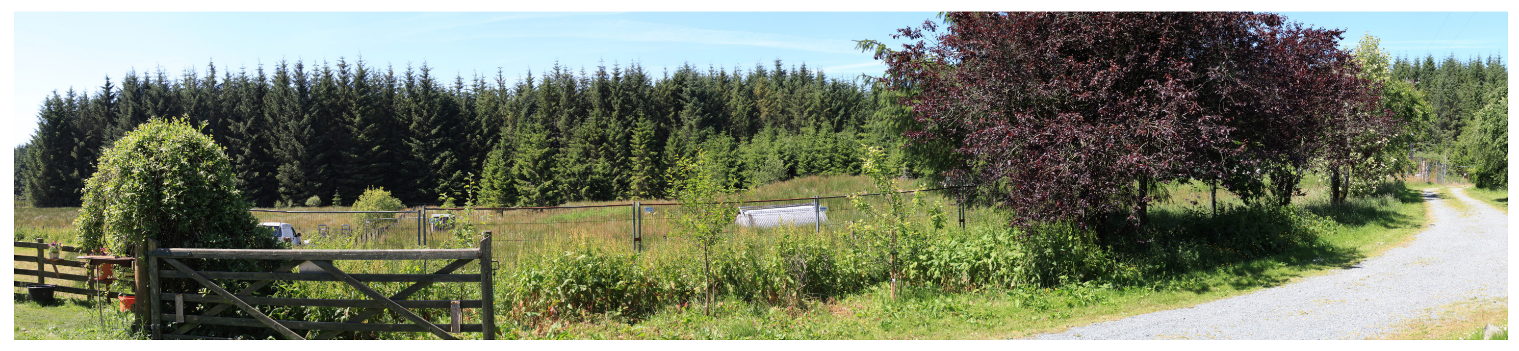
View west from the north of the house.