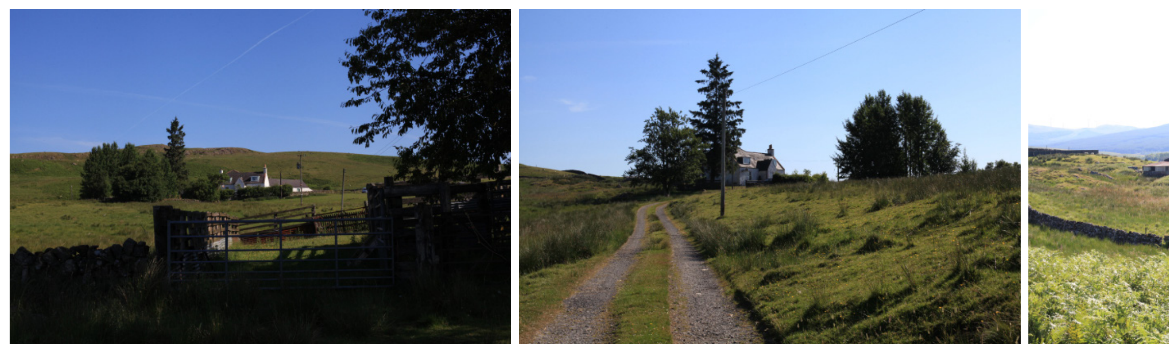
View towards the property from the B729.