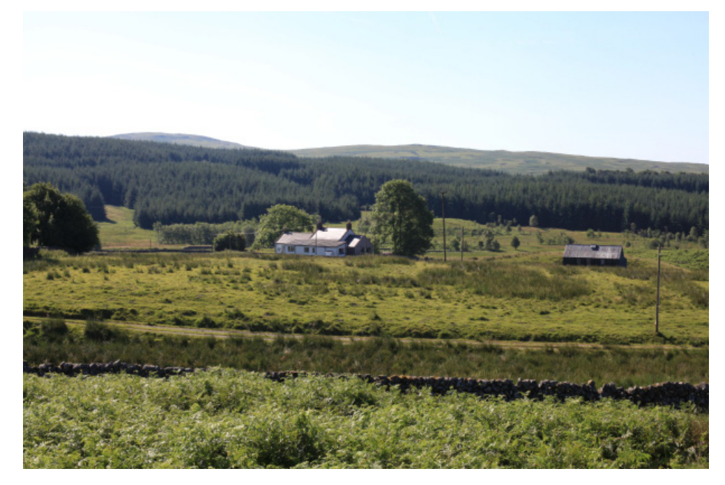
View illustrating the propensity for southern views from the property.